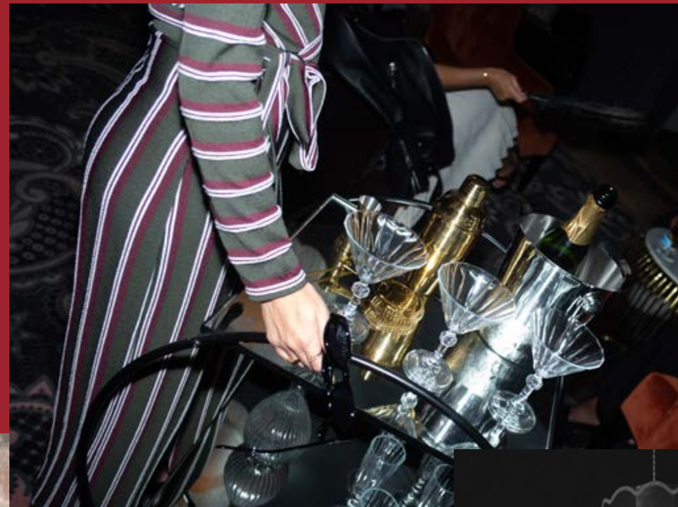
Ce qui se passe à paris reste à paris